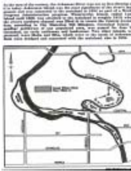
Islands in the Stream

of course all the concession stands. It was mostly a summertime evening and Sunday activity. The article also states that there was an indoor theatre (Crawford Theatre), which brought colorful, attractive stock company actors and directors to the area.