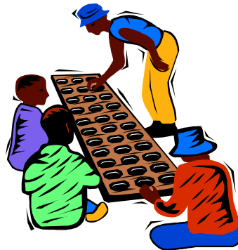
Watoto provides education, medical care and spiritual guidance to AIDS orphans in Uganda.