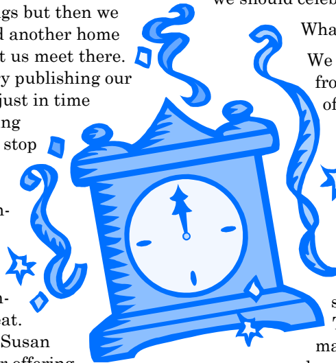
Time Flies When You're Having Fun!